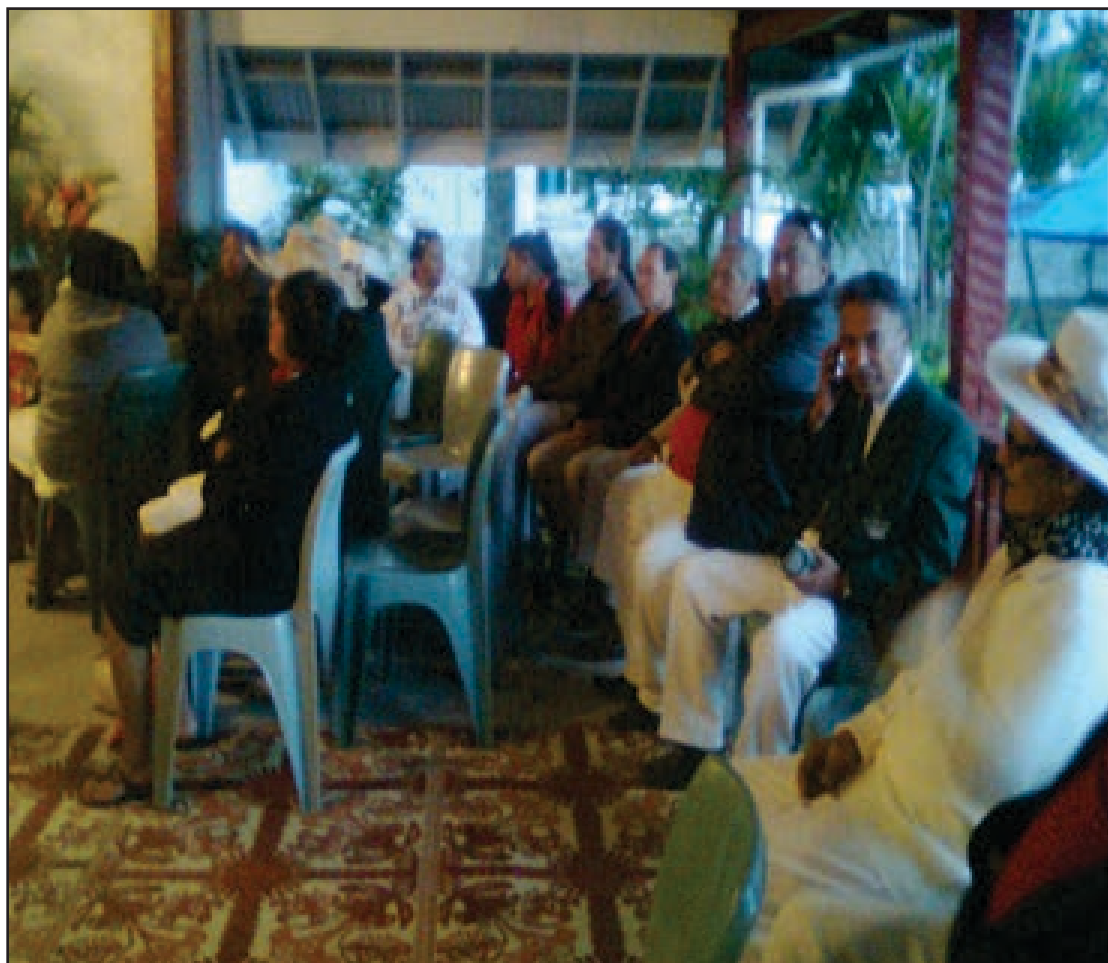
President, Bowls Cook Islands with Members of the Arorangi BC await for their turn, Kave Pure at the Tinomana Palace last night.